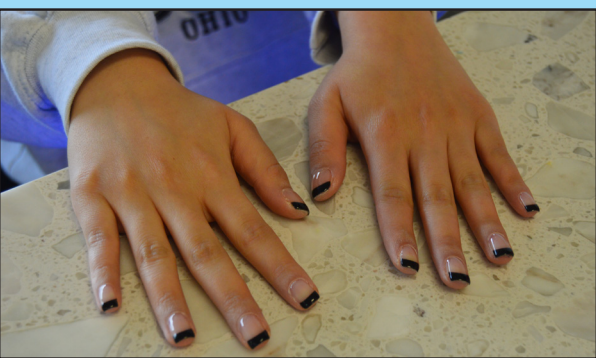
(Above) Senior Duyen "Holly" Bui models her french tips. A french tip manicure or pedicure polishes the nails in two colors, one for the nail's bed, the other for the tip.