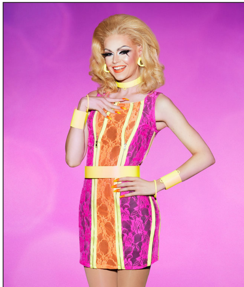
Blair St. Clair poses for her season 10 photoshoot, sporting a 60s-inspired neon dress.

"Blair St. Clair is a young, effervescent girl who loves vintage fashion," says St. Clair — referring to "herself" in third person. "She's a free spirit and a fresh twist but classic and refined."